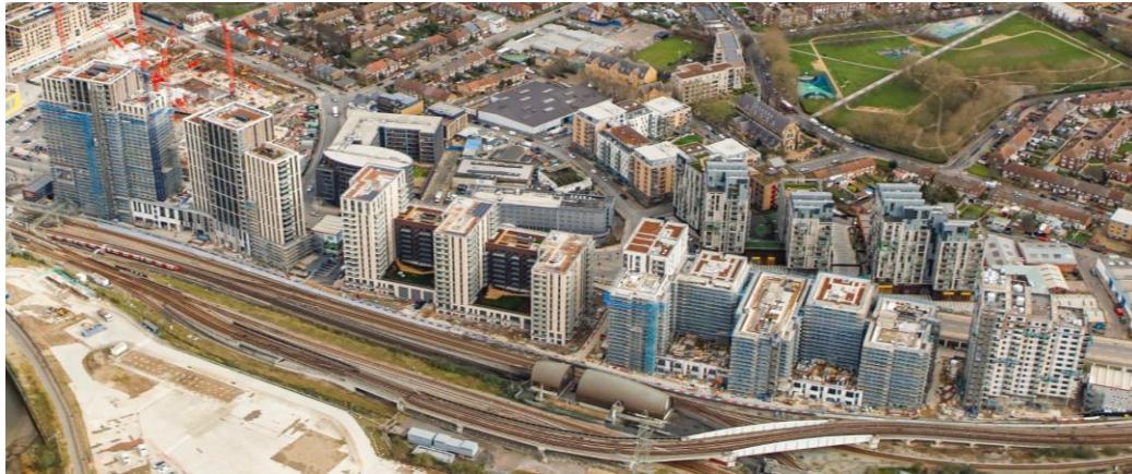
Brunel Street Works