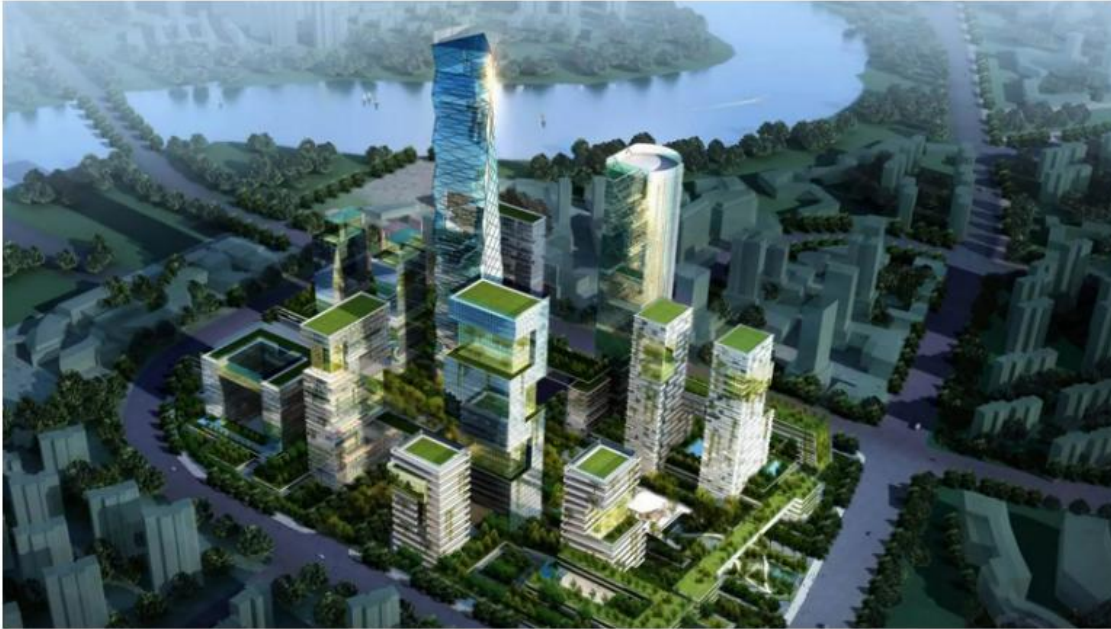
The world's biggest eco-city in development, Tianjin Eco-city will be around half the size of Manhattan.