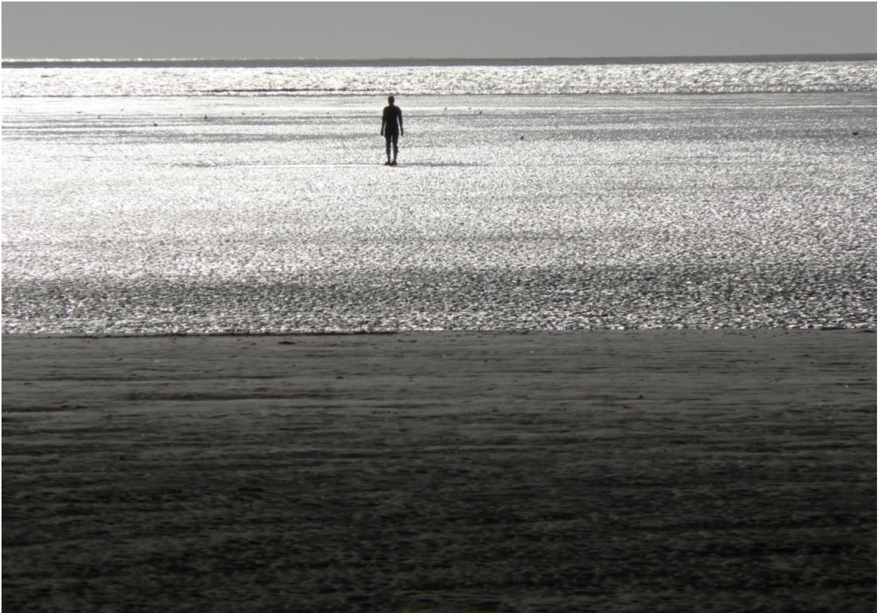
Ken Dafft – the last known picture