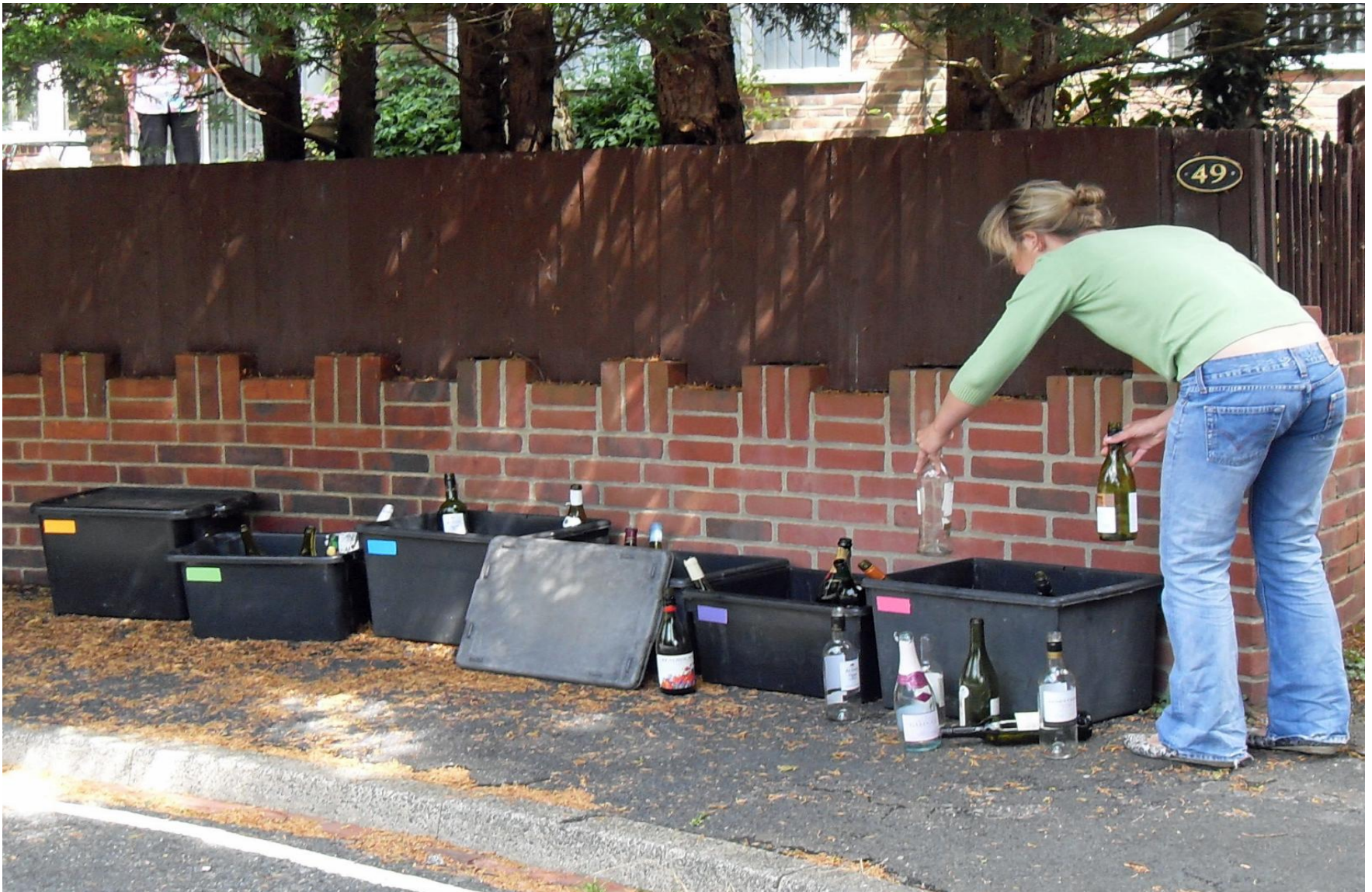
Dunromin requires its residents to sort their weekly recycling by grape type