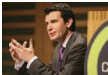
ZERO CARBON HUB ANNUAL CONFERENCE 2011